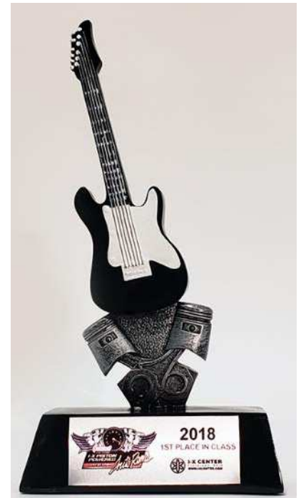
2018 trophies created by Everlasting Memorial Jewelry