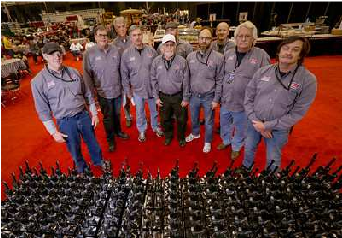
2018 ISCA JUDGES WITH THE SHOWS ONE-OF-A-KIND TROPHIES

The 2018 show awarded more than 600 trophies and $27,257 in cash to winners in the ISCA vehicle series which included motorcycles. Keeping with the Rock n' Roll theme, the show created one-of-a-kind piston powered guitars for the winners.